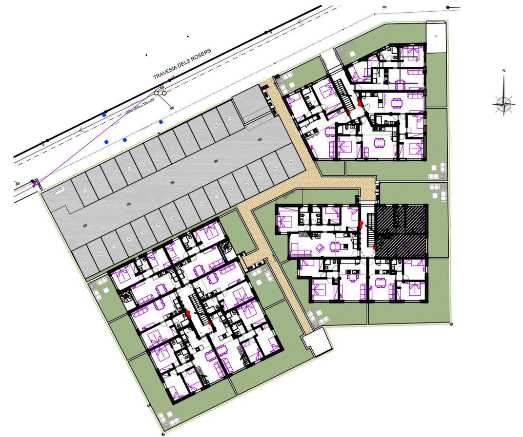
Edificio 2 - Planta Piso - Solarium Vivienda E