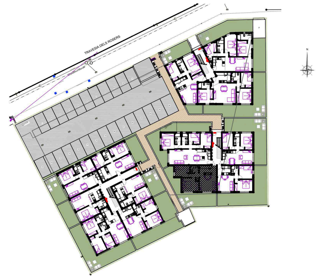
Edificio 2 - Planta Piso - Solarium Vivienda G